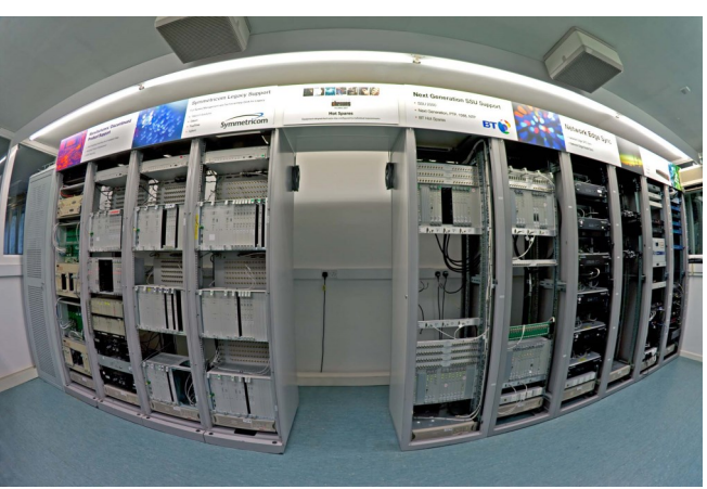
The Chronos Hot Spares Support Facility

Chronos operates a 24x7x365 support (Service Support Plan – SSP) desk for nearly 100 timing equipment users in over 50 countries around the globe. The first call into the Chronos support team came at 02:00 UTC from a panicked engineer from Customer A who had been called out of bed by their Network Operations Centre (NOC) reporting alarms at а handful of Microsemi (Symmetricom) SSU2000s. were These disqualifying GPS inputs due to the Maximum Time Interval Error (MTIE) metric being outside of set limits. The customer's engineer was concerned as three sites had gone into